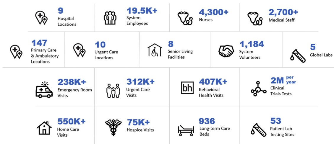
Figure 1. The Integrated Health System